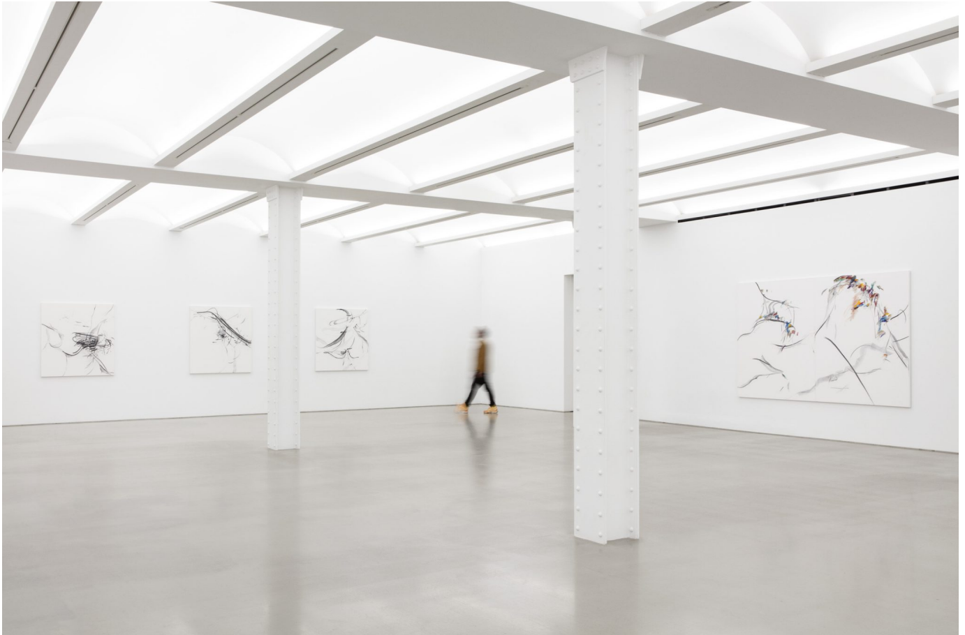
View of the XIYAO WANG's personal exhibition at the PERROTIN (2024)

Compared to my last solo show this summer at Perrotin Seoul "Allongé – Out of Reach" which was partly inspired by ballet, my current show in Beijing "Liang Xiao Yin" (Tang Contemporary December 16th, 2023 – January 28th, 2024) and upcoming show in New York "Do you hear the waterfall?" (Perrotin January 12th – February 24th, 2024) are more leaning back to my roots that are connected to such cultural Chinese themes like Taoism and mythology.